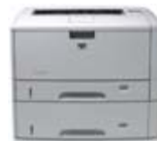
HP LaserJet 5200tn printer